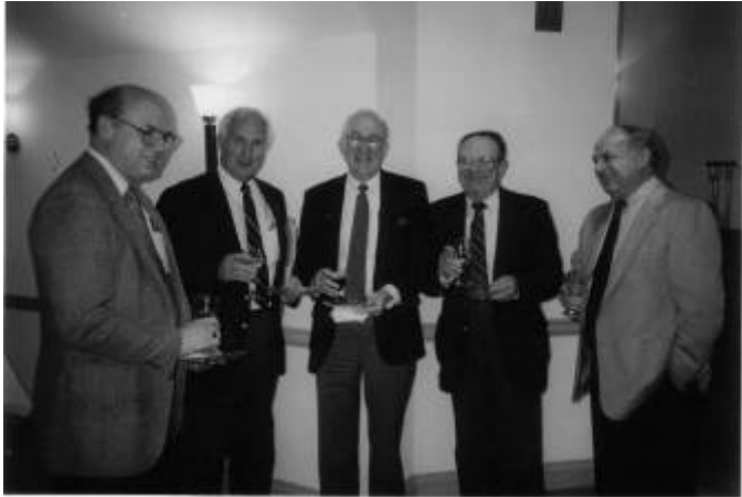
A snapshot of some of the Executive Council members enjoying a break in Fall 1992 at the Nittany Lion Hotel, State College.